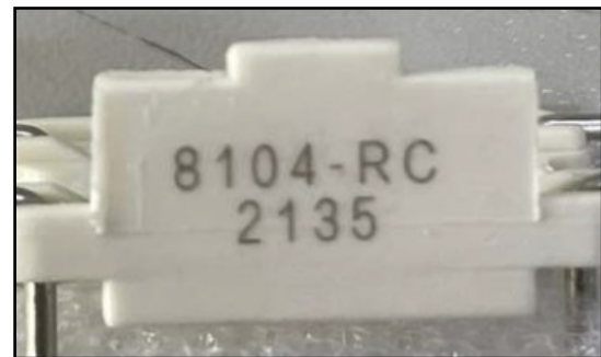
2100LL, 2200LL, 2300LL Series: